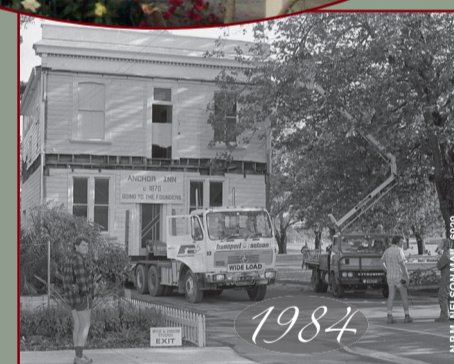
ABOVE Anchor Inn leaving for a journey to Founders Park. It was threatened with demolition on its original Haven Road site.