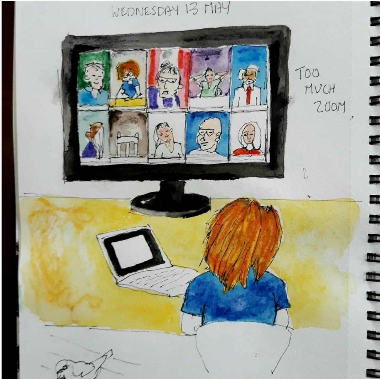
Too Much Zoom...